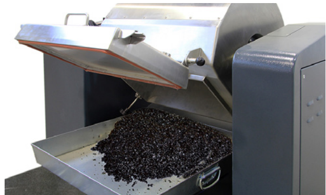
77-PV0077/C Detail of unloading. The mixing cylinder is rotated by a motorized tilting system for easy unloading. The tilting angle is adjustable to 130° to speed up the unloading operation