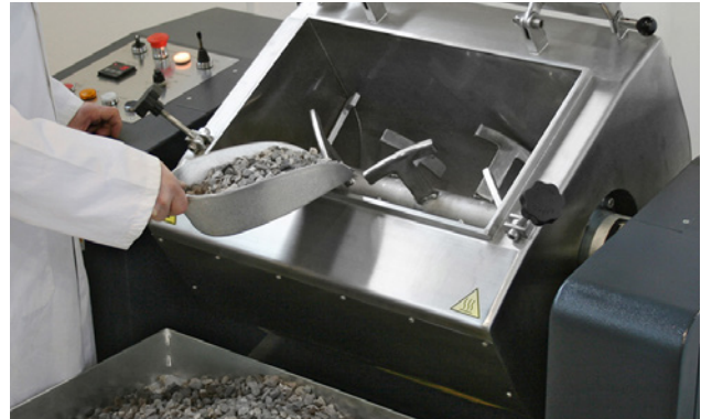
77-PV0077/C Detail of aggregate loading