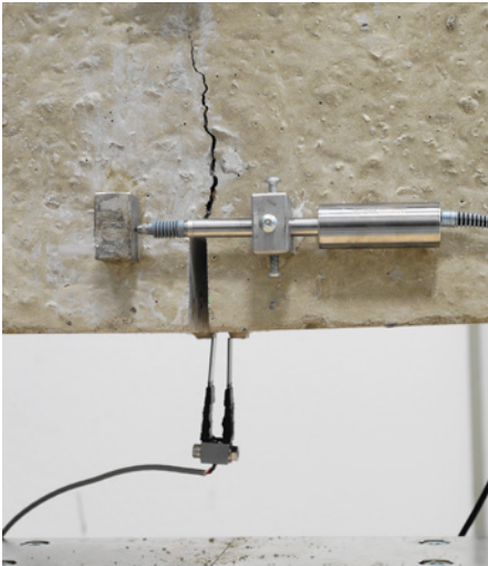
CMOD testing to EN 14651

Please visit www.controls-group.com for more information.