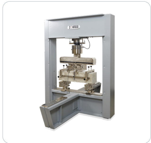
DUPLEX, testing FRC beam to ASTM C 1609

These high stiffness flexural frames have been especially designed for displacement controlled testing on advanced construction materials, e.g. Fiber Reinforced Concrete (FRC) and sprayed concrete.