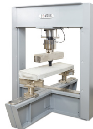
Kerbs testing to EN 1340