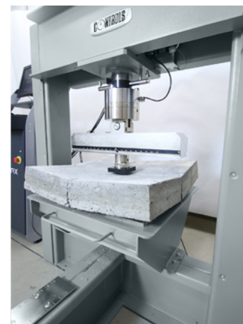
Energy absorption test to EN 14488-5