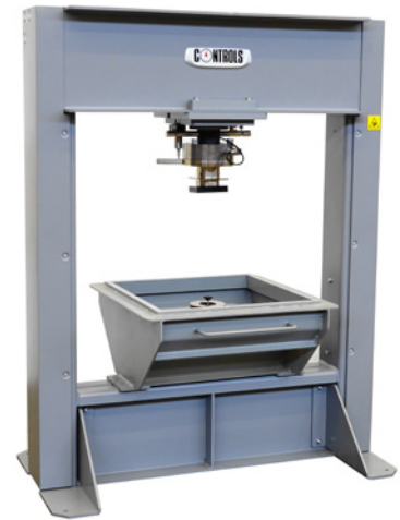
Energy absorption test set-up to EN 14488-5

* The vertical daylight can be reduced by using the distance pieces already included to reduce the daylight by: 50 mm, 80 mm, 100 mm, 130 mm, 150 mm and 180 mm. Additional distance pieces are available as accessories.