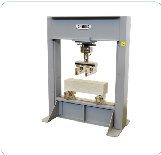
SIMPLEX, concrete beam testing

EN 1339 | EN 1340 | EN 12390-5 | ASTM C78 | ASTM C293 | ASTM C1550 | EN 14488-5 | ASTM C1609 | ASTM C1018