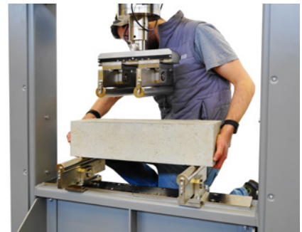
Easy frontal positioning of the specimen