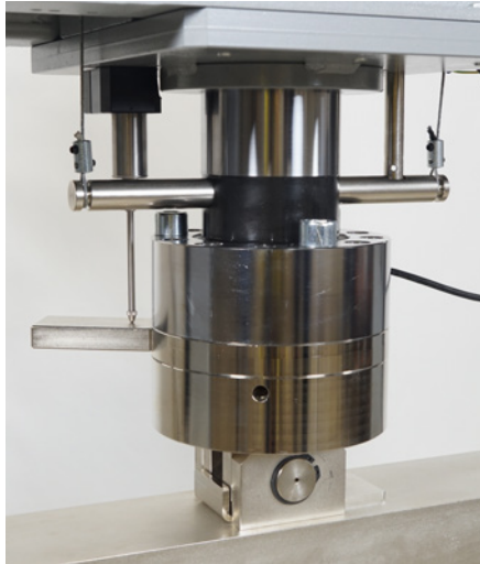
Piston travel displacement transducer