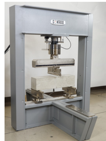
Testing FRC beams to EN 14651

* The vertical daylight can be reduced by using the distance pieces already included to reduce the daylight by: 50 mm, 100 mm and 150 mm. Additional distance pieces are available as accessories.