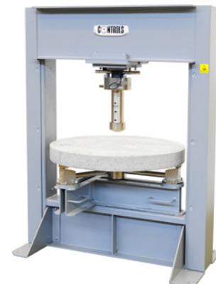
Flexure testing on FRC round panel to ASTM C 1550