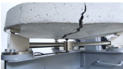
Round slab test to ASTM C1550 travel displacement transducer