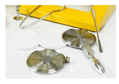
4 Set of trimming tools, set of rubber moulds, interface cables, USB adapter and user manual