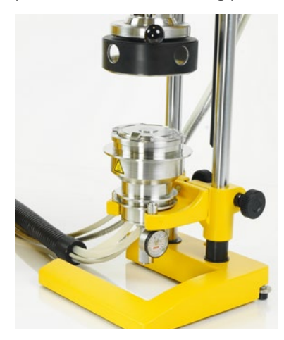
3 Software Manager for Bitumen tests

2 Peltier unit: Peltier control unit, peltier temperated basic plate, basic plate support, adapter, exchange grip, two exchangeable plates (ø 25mm and ø 8mm), measuring plate P3 (ø 25mm), measuring plate P4 (ø 8mm)